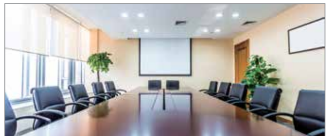
Auditorium, seminar/meeting rooms